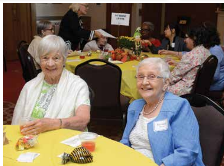
The growth of the parish can also be seen through the increase of the attendance at the monthly Senior Lunch.