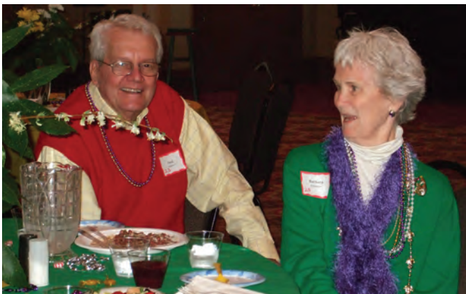
Senior adults share good times at the Senior Lunches held throughout the year.