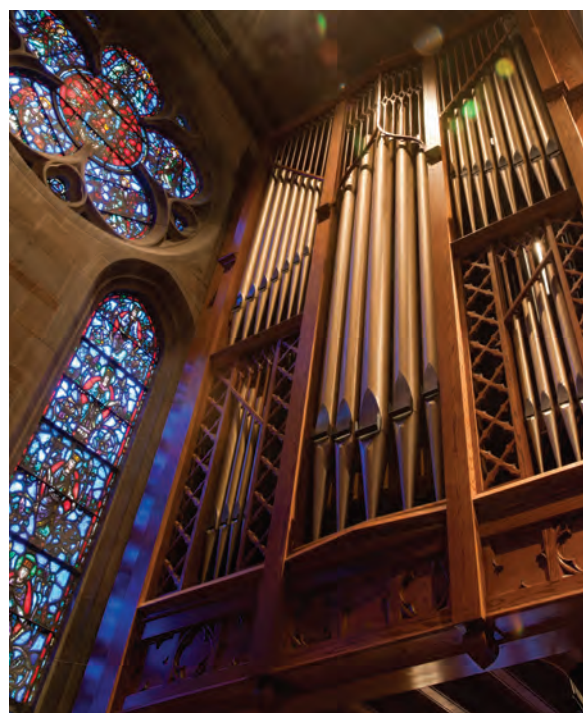
Our magnificent 3,300 pipe Goulding & Wood concert organ has been encouraging prayer and song for over 70 years.