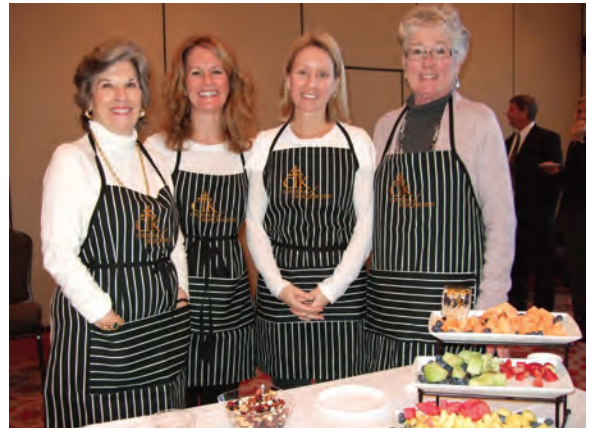
225 volunteers support the Funeral Ministry. The Funeral Reception Committee hosted 15 funeral receptions.

It only takes a simple act such as making a sandwich to make an impact. With Cathedral Volunteers, 7,300 sandwiches are made for shelter and summer lunch programs. More than 100 Parishioners assembled and distributed 2,400 snack bags to those less fortunate than ourselves.