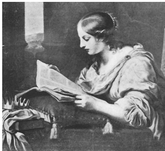
St. Catherine of Alexandria, by Carlo Dolci, 1616-1686