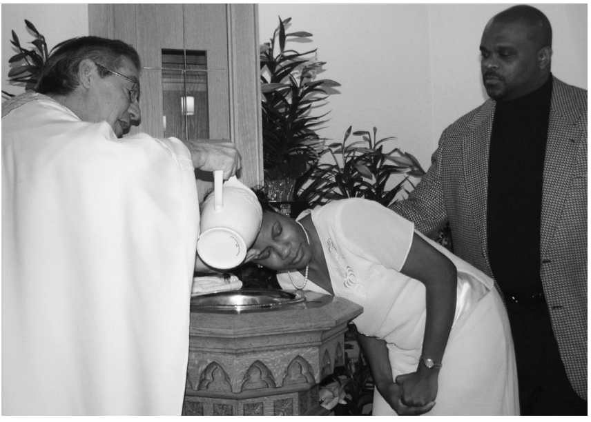
An adult Baptism during the Easter Vigil Mass

9:33-37; Lk 9:46-48). The salvation of those who do not know Jesus is further supported by the fact that these people who make sincere efforts to seek truth and to do the will of God to the best of their understanding would have desired Baptism if they had known of its necessity.