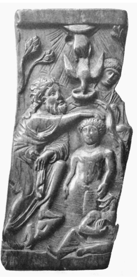
Baptism of Christ, 6th century ivory panel from northern Italy

"Through this union with Christ in Baptism, we receive both the forgiveness of sins and new birth through the Holy Spirit."