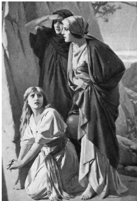
Women at the open tomb on Easter morning, late 19th century lithograph

“Our faith is in Jesus because only he has the words of eternal life.”