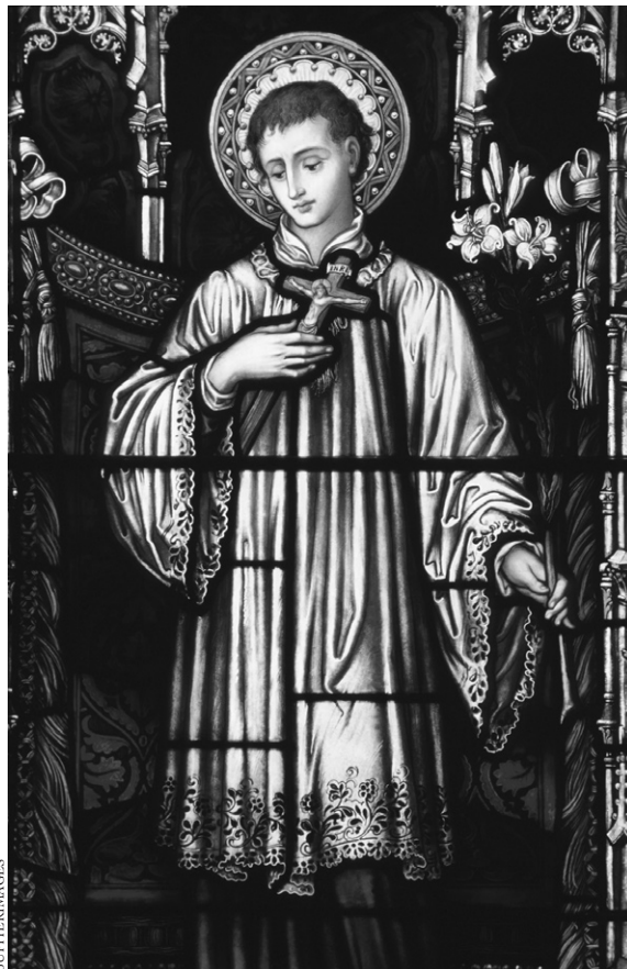
Stained glass window of St. Aloysius Gonzaga, 1568-1591

“The Christian life is really a school of faith.”